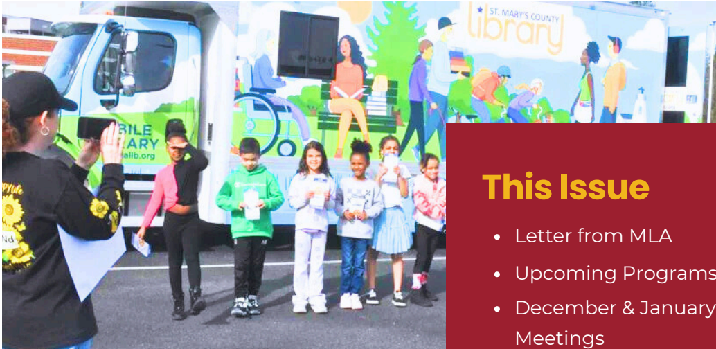
Photo from St. Mary's County Library's 75 th Anniversary